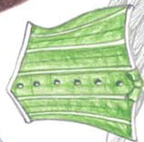
CORSET, DRESSING GOWN AND STOCKINGS FOR EMMAFINE