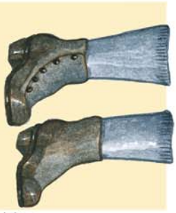
WORK SHOES FOR OLIVIA

Reconstruction © 2011. All rights reserved. The story and characters in this publication are fictional. Any resemblance to actual persons, living or dead (excepting satirical purposes) is purely coincidental. No portion of this publication or its supplements may be reproduced by any means (excepting legitimate reasons of review) without express permission from the author.