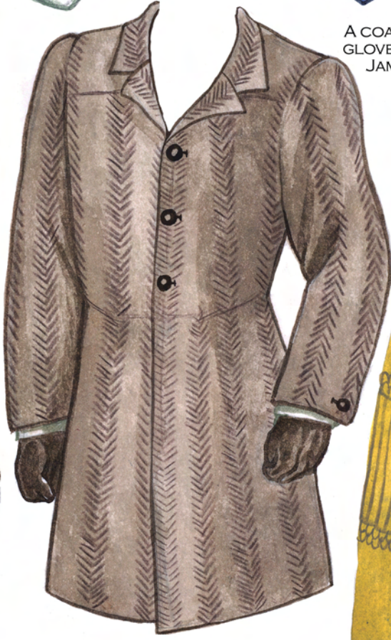
A COAT AND GLOVES FOR JAMES