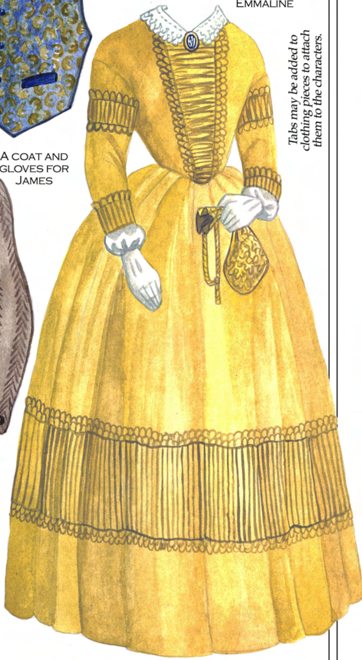
A TRAVELING DRESS WITH SIMPLE TRIMMING, GLOVES, AND A RETICULE FOR EMMALINE

Tabs may be added to clothing pieces to attach them to the characters.