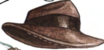
A HAT FOR JAMES cut along the dotted line for proper fitting