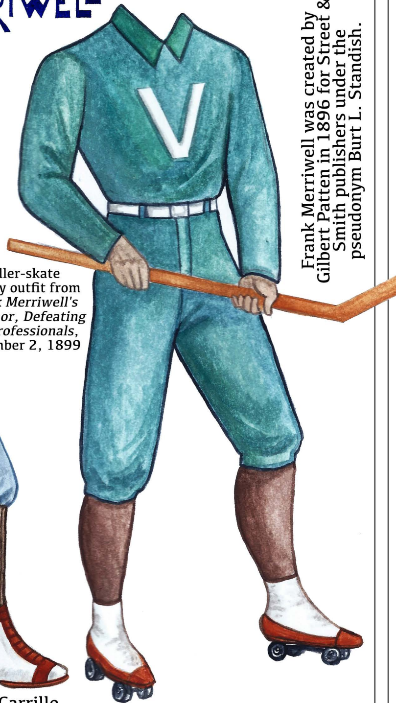
Frank Merriwell was created by Gilbert Patten in 1896 for Street & Smith publishers under the pseudonym Burt L. Standish.

For more 19th-century-themed paper dolls visit: http://19thcenturypaperdolls.weebly.com/